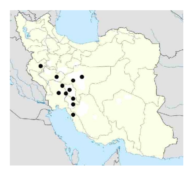
Fig. 2. Distribution map of Eremostachys adenantha in Iran.