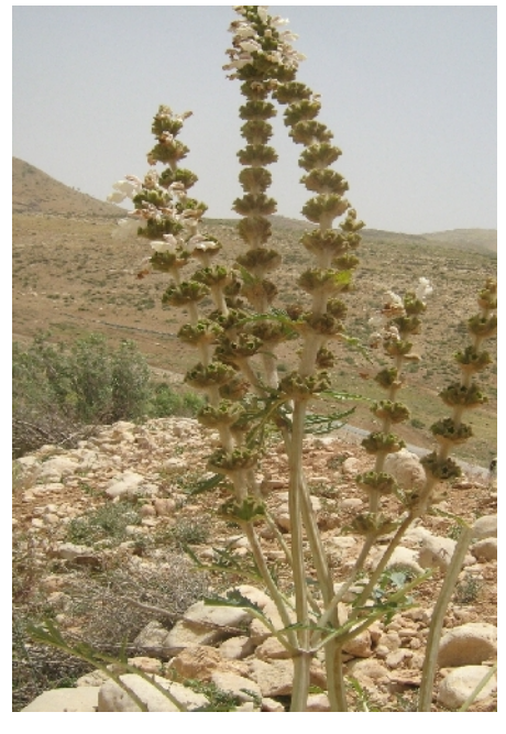
Fig.1. Eremostachysadenantha in KB province, Iran.